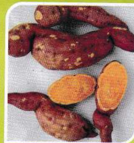
Figure 2: Kabode (SPK004/4/6)