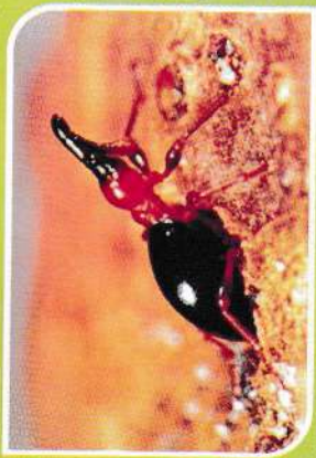
Figure 3: The sweetpotato weevil.