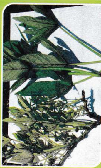
Figure 5: Plants infected with virus (left), normal plants (right).

Viruses can cause a very high yield loss and often result in the production of small roots that cannot be sold. Viruses are passed between plants by small flying insects known as whiteflies and aphids.