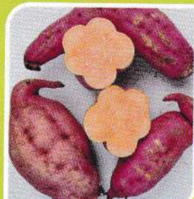
Figure 1: /1aa (SPK004/6)

Plant 1 vine per hole and 30 cm apart along the ridges.