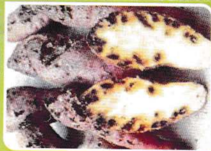
Figure 4: Roots affected by sweetpotato weevil

Weevils lay eggs in older woody parts of the vine. It is therefore recommended that the top half of the vine is used as planting material to avoid weevils.