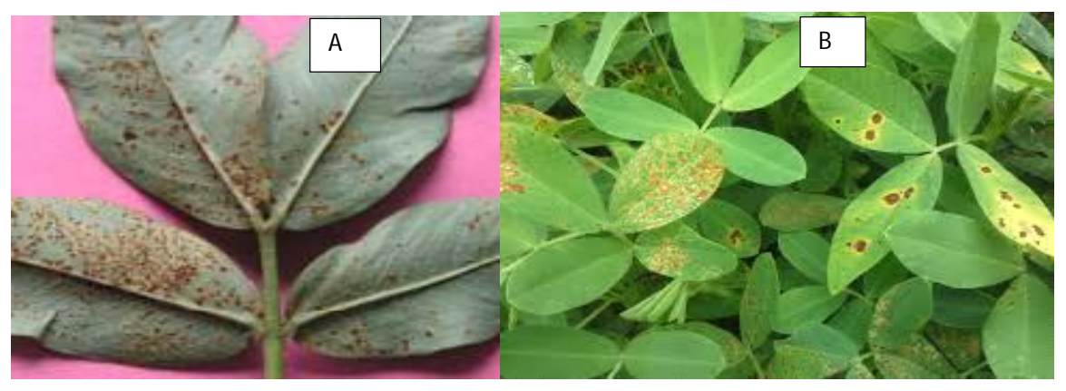
Fig 2: Groundnuts rust pustule at the lower (A) and upper (B) parts of the leaf.

Cultural control: Prevention of the outbreak or proliferation of P. arachidis in farmers' fields should be prioritized to minimize any damage to the crop and to minimize costs associated with other control strategies. Introduction and spread of the inoculum to areas where it has not been can be avoided through regulating the movement of groundnut plant materials across regions or boarders by enforcing strict phyto-sanitary inspections at quarantine stations. In groundnut producing areas where rust is a constant threat, adoption of crop rotations involving cereals or other nonhost species is effective to avoid disease carryover (Mondal et al. , 2014). Small-scale farmers particularly in the semiarid tropics often intercrop groundnuts with either pigeon pea ( Cajanus cajanL. ), sorghum ( Sorghum bicolor ), cassava ( Manihot esculenta Crantz), pearl millet ( Pennisetum )